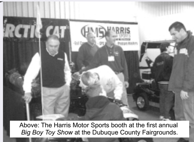
Above: The Harris Motor Sports booth at the first annual Big Boy Toy Show at the Dubuque County Fairgrounds.

Visit our booth at the Chicagoland Golf Show March 19-21!