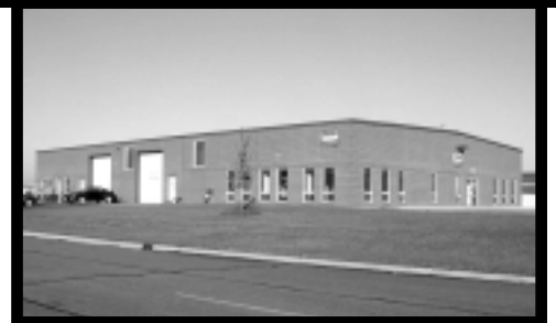
SUGAR GROVE, IL—590 Heartland Drive