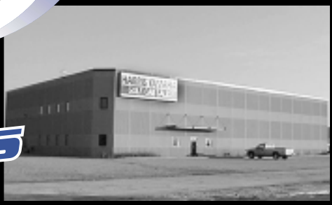
PEOSTA, IA—9875 Kapp Court